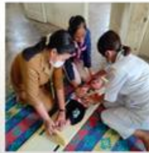
Kegiatan pengukuran TB dan BB Balok di desa Perkebunan Buh