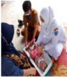
Kegiatan pengukuran TB dan BB Balok di wilayah Perkebunan Jaya