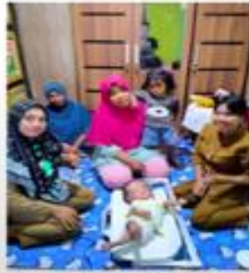
Kegiatan pengukuran TB dan BB Balok di wilayah Perkebunan Hutan Lama